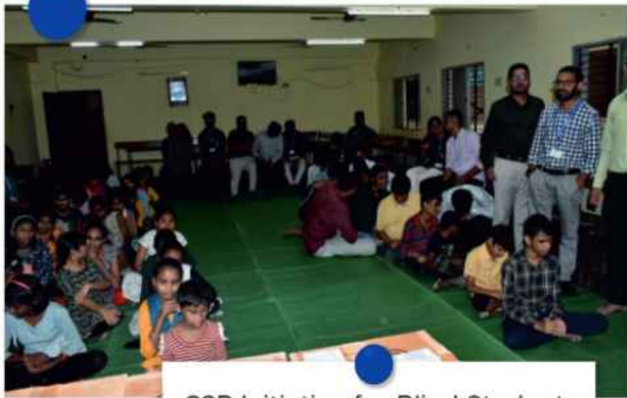
CSR Initiative for Blind Students on POLA Festival