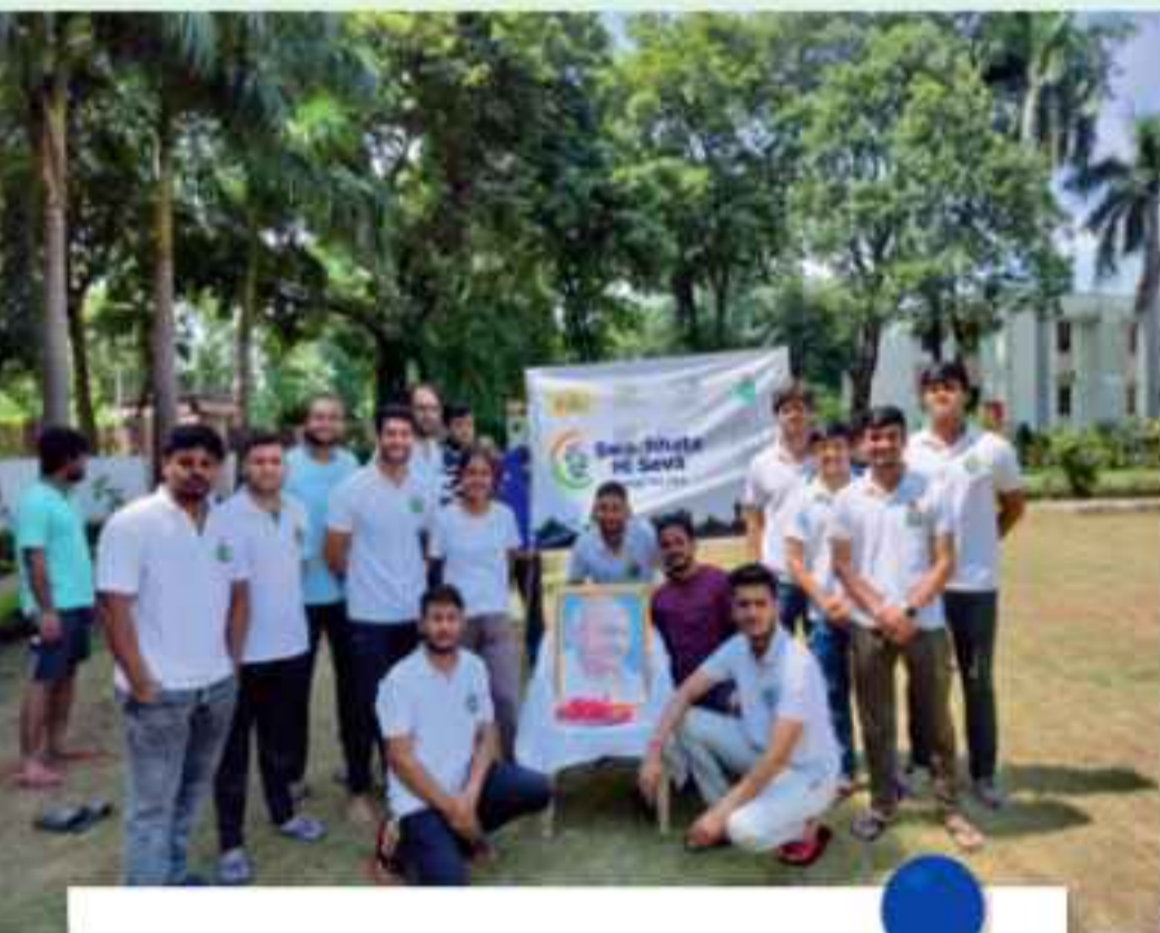
Other Cultural Activities