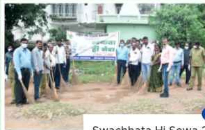
Swachhata Hi Sewa 2024