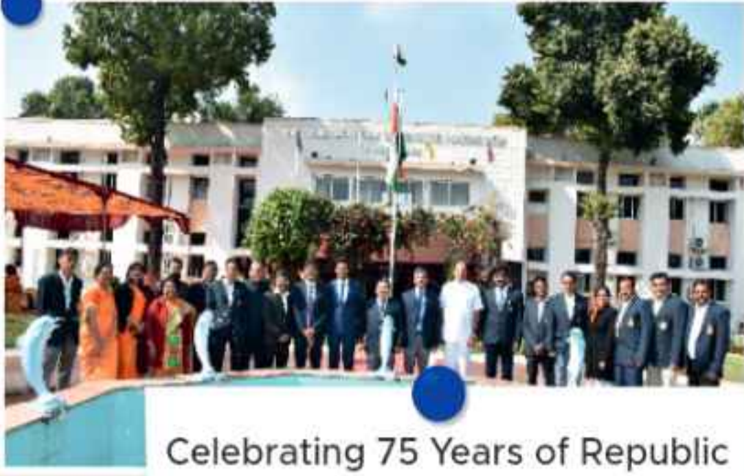
Celebrating 75 Years of Republic

NADP is taking a giant leap towards sustainability in 2024 with our Holistic Sustainability Program, featuring campus bicycles, waste reduction strategies, renewable energy, workshops, and green spaces.