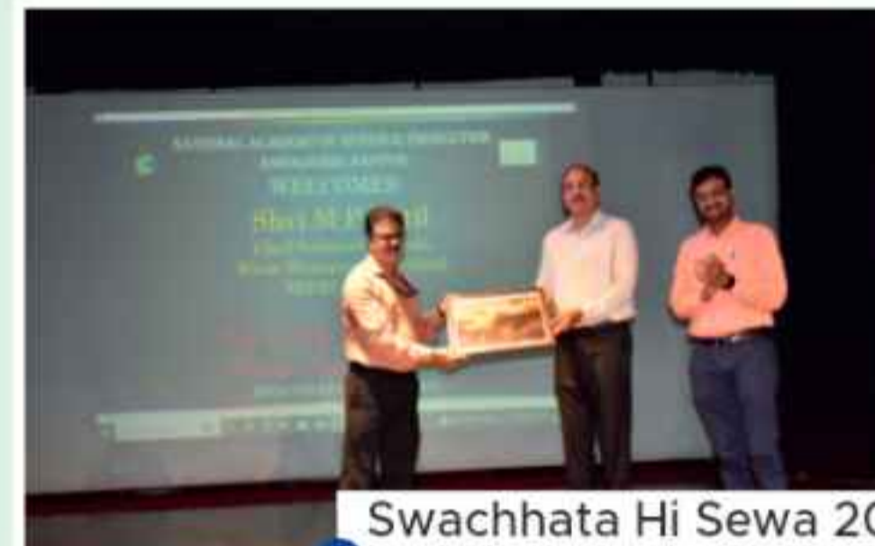
Swachhata Hi Sewa 2024 Campaign