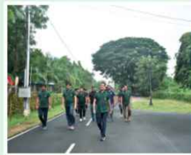
Explore Social Impact and Gandhian Values at Anandwan and Sewagram

Spreading Light Together at NADP! we brought smiles to the faces of the residents at Panchavati Vridhasram with sweets, dry fruits, and firecrackers.