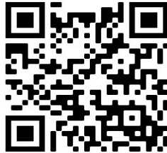
QR Code for Hospital Location

For Google Map location (click the link below): https://goo.gl/maps/EZNBWNJpZRz21DbV6 Link for Filling of Application Form: - https://forms.gle/XPMyx74PgonhHKVCA